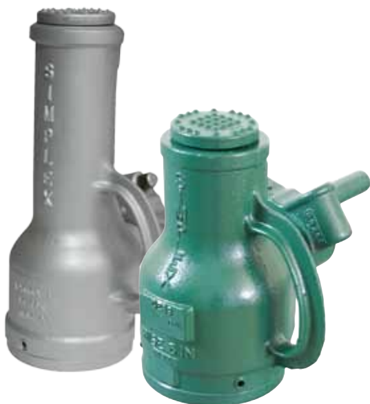
Models: JJA2515C & JJ3510D